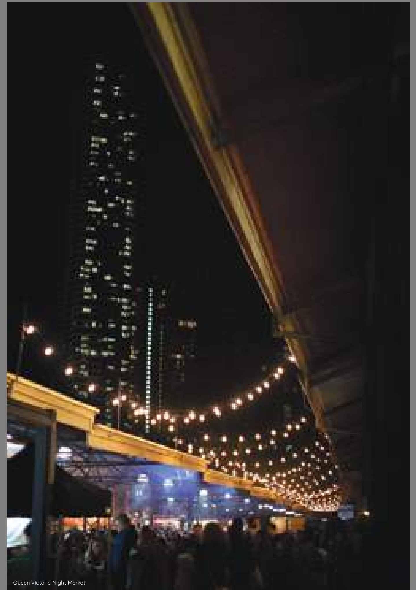
Queen Victoria Night Market

When the lights of the city come on at night, the city undergoes a spectacular transformation to one of international recognition.