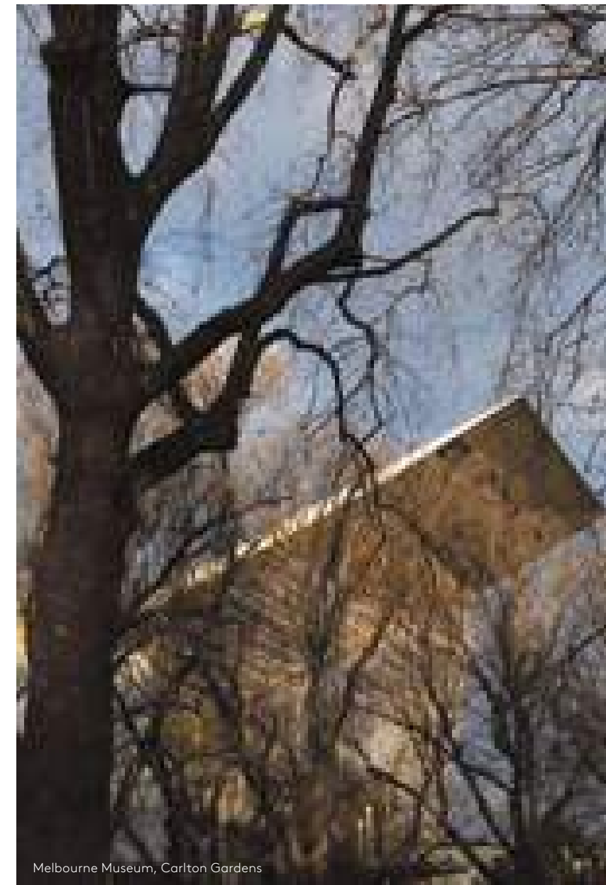
Melbourne Museum, Carlton Gardens

A wander through North Melbourne offers a landscape of contrasts, where contemporary architecture sits alongside green expanses of parkland. Here, everything works together as one.