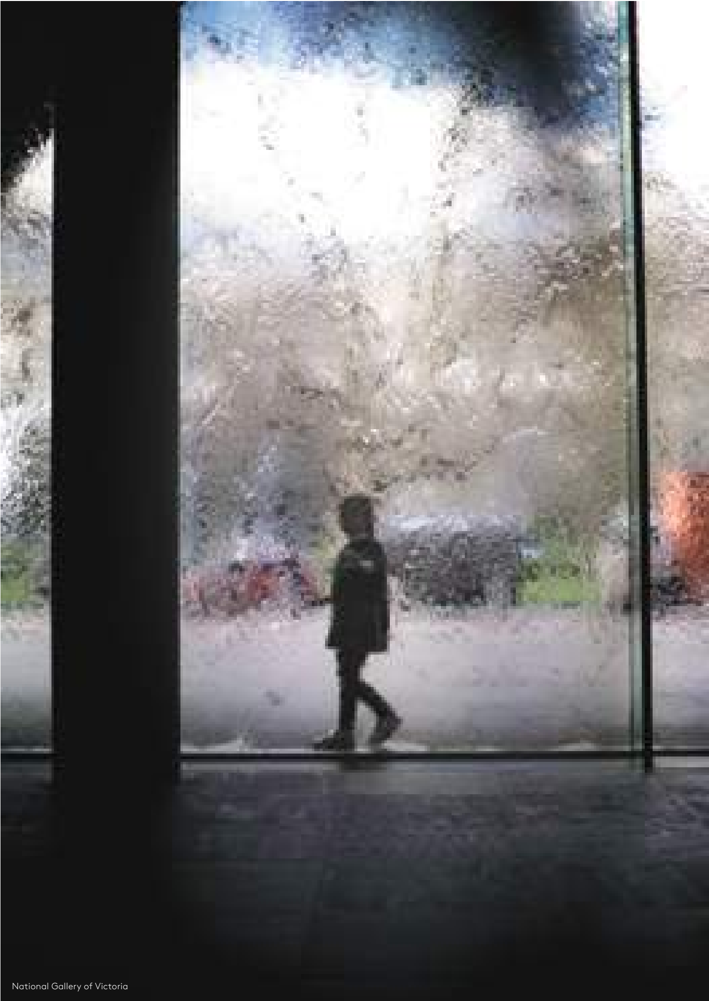
National Gallery of Victoria

In parallel to some of Melbourne’s most sought after suburbs such as East Melbourne and Carlton, North Melbourne enjoys the luxury of walking distance to the centre of the city. By tram you can be amongst the city’s famed international attractions within just five minutes.