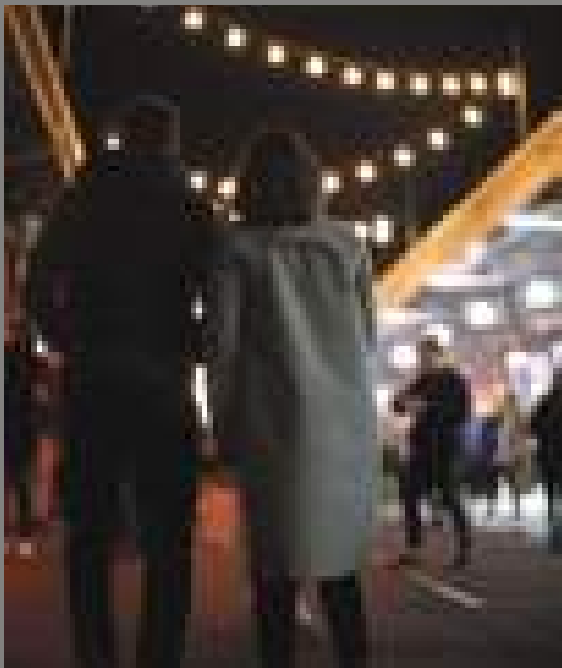
Vibrant night markets, quiet wine bars and traditional pubs all offer places to unwind at your own pace in North Melbourne and the city.