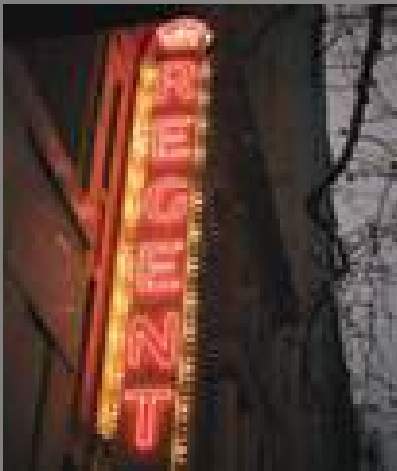
From home-grown comedy to Broadway shows, and music of every genre, Melbourne’s cultural scene offers something to do every night.