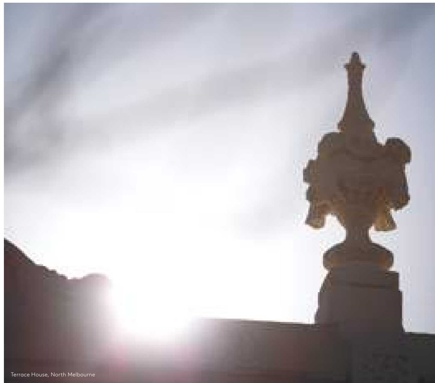
Terrace House, North Melbourne

The heritage character of North Melbourne has been carefully preserved, where modern cafés, shops and residences sit behind detailed façades from years gone by.