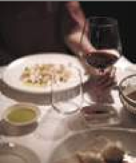
Melbourne takes its eating seriously, which has placed it on the international stage of progressive restaurants and dining.

From restaurants and rooftop bars to theatres and night markets, North Melbourne and the city are home to a seemingly endless selection of entertainment.