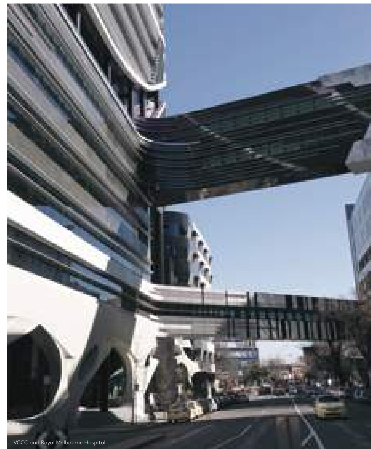
VCCC and Royal Melbourne Hospital

Set within leading-edge architecturally-designed buildings, the Royal Children's Hospital and the Victorian Comprehensive Cancer Centre are recognised for the breakthrough work and vital care they give the community. The precinct is also home to the Royal Melbourne Hospital, the Royal Women's Hospital, the Melbourne Brain Centre and many more institutions which are linked not only in collaboration, but in physical structures with bridges across streets.