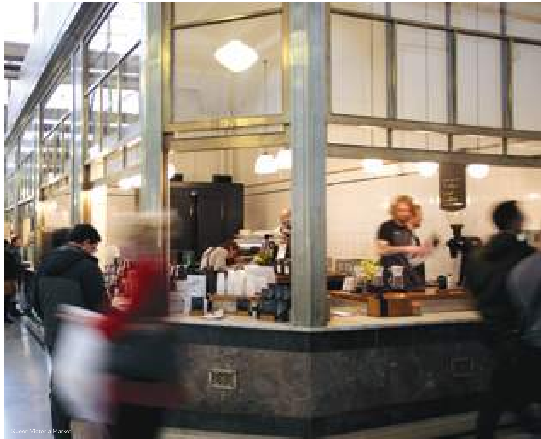
Queen Victoria Market

The redeveloped market will be a zero carbon, zero waste operation, as well as being home to 1.5 hectares of new open space with the car park moved below ground. The iconic heritage sheds will be retained and restored, guaranteeing the tradition of an open-air market, and room for even more businesses to continue providing fresh produce to the city for years to come.