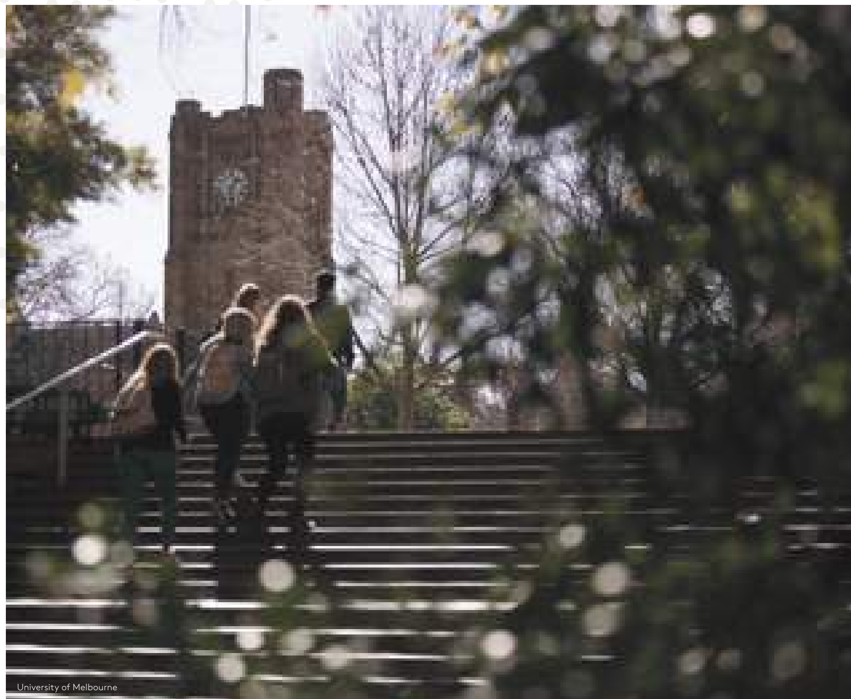
University of Melbourne