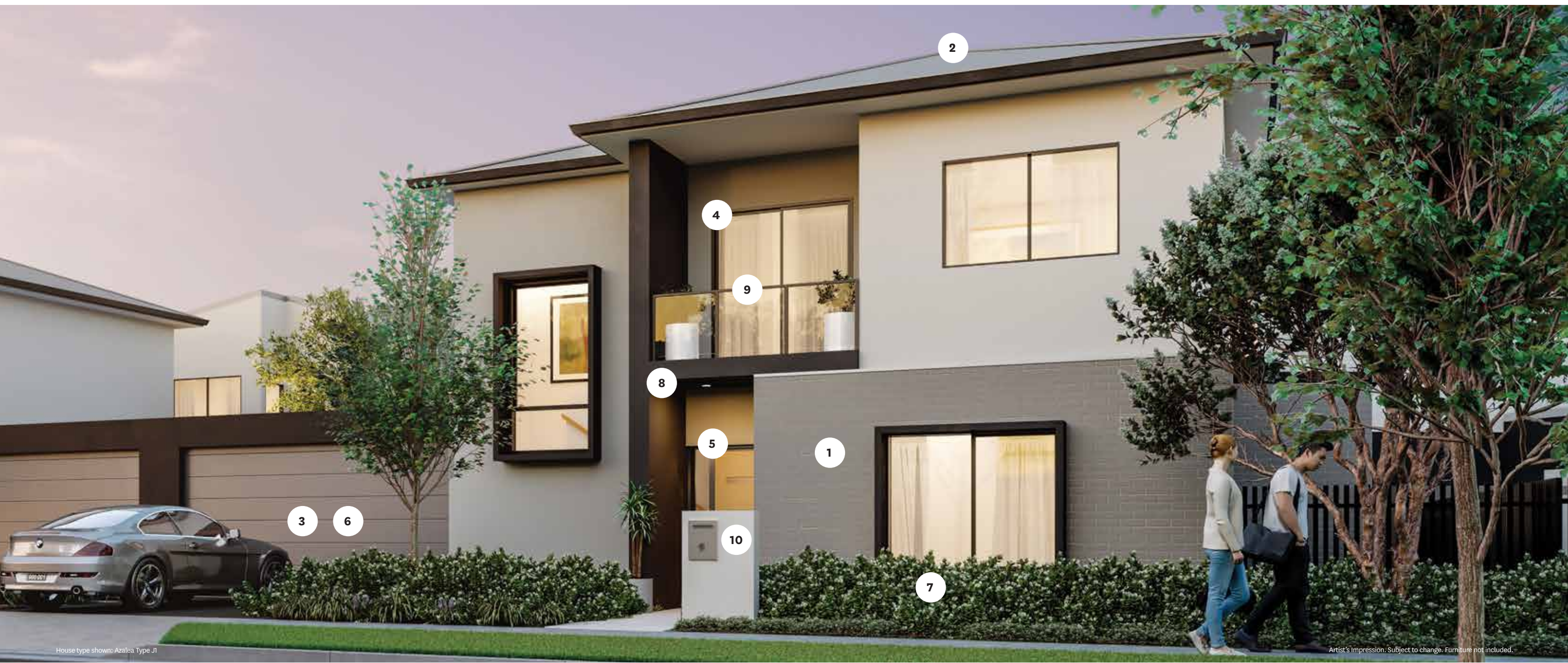
House type shown: Azalea Type J1

Your contemporary architect-designed home is complemented by the natural landscaping of your neighbourhood – with many homes looking out towards the surrounding parklands or Dandenong Ranges. Additionally it's smart built-in eco features make life at Waterlea more energy-efficient.